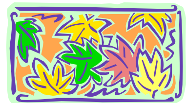
Watch for the rainbow of fall colors