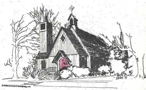
The little white Church with the red doors